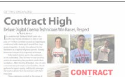
EMBEDDED PHOTO SETS