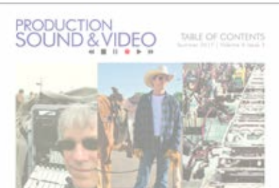
EMBEDDED PHOTO SETS