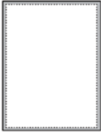
Full Page Bleed or Non-Bleed